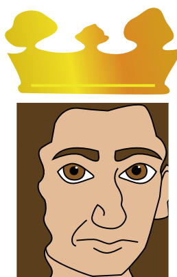
HENRY THE FOWLER