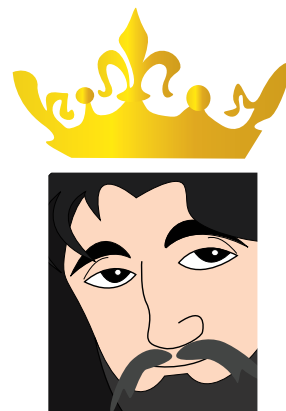
WILLIAM THE CONQUEROR